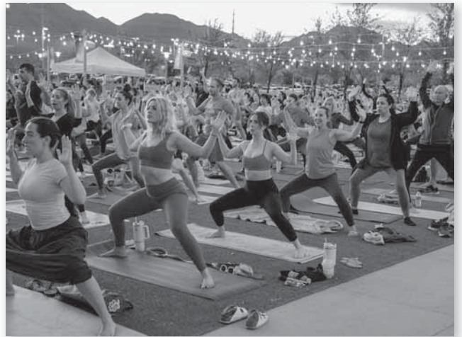
Fitness on the Lawn, held every Tuesday evening, is one of several summertime events that is returning to Downtown Summerlin.

At Las Vegas Ballpark® , home of the Las Vegas Aviators®, the city's professional MiLB team of the Pacific Coast League, games run all summer long through September 21.