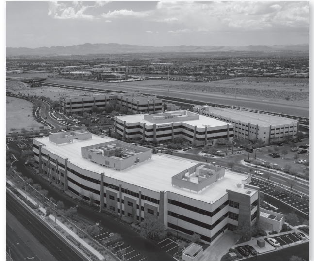
The College of Medicine at Roseman University in Summerlin recently received accreditation. The college will open its doors in July and began accepting application in March.

As part of this approach, the program incorporates clinical training through GENESIS, an innovative house-