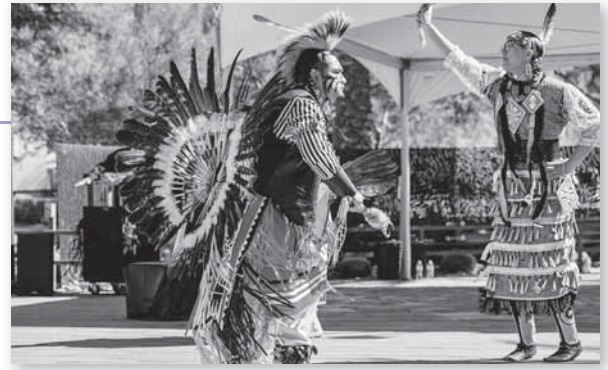
The Paiute Spring Festival is one of several events at Downtown Summerlin this spring. For all event details, visit Summerlin.com .

The Third annual Lei Day parade returns to Downtown Summerlin on Thursday, May 1 in celebration of Asian