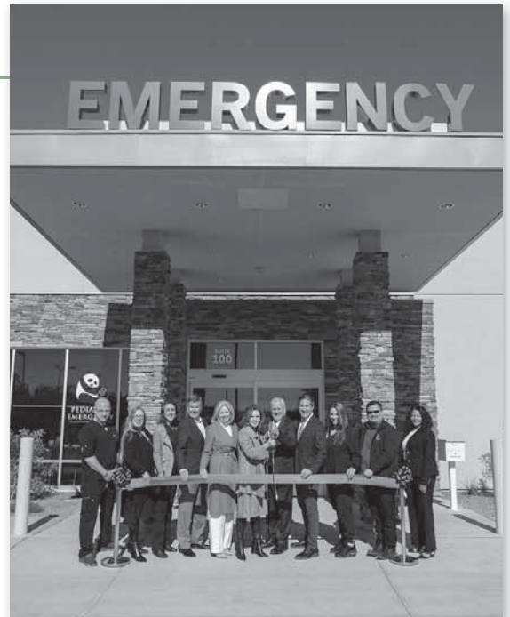
A ribbon-cutting for the new ER at South Summerlin was held on January 30. The full-service, 24-hour, freestanding Emergency Room owned and operated by Summerlin Hospital Medical Center opened to the community on February 3.

Diagnostic capabilities include an on-site laboratory, CT scanner and imaging equipment, along with multiple treatment rooms, exam rooms, a decontamination room