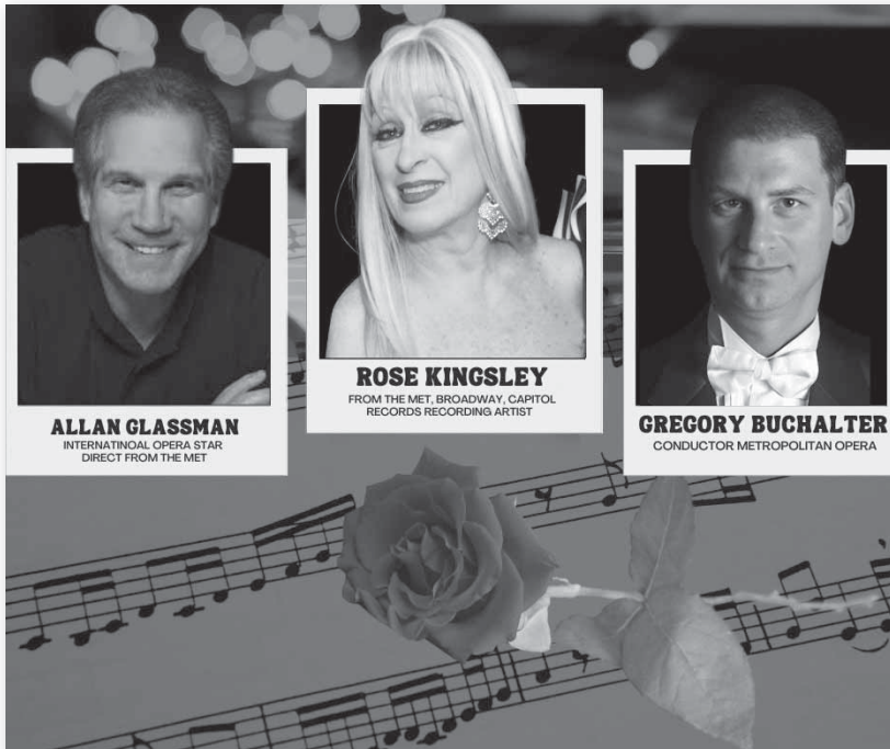
ALLAN GLASSMAN INTERNATIONAL OPERA STAR DIRECT FROM THE MET