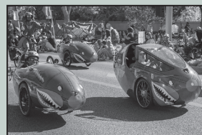
Forgotten Not Gone Veteran Trike Brigade - First Place