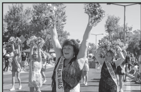
Vegas Golden Gals First Place