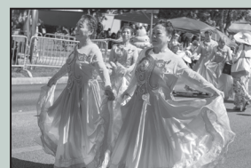
Las Vegas Spring Breeze Dance Group - Third Place