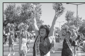
Vegas Golden Gals Second Place