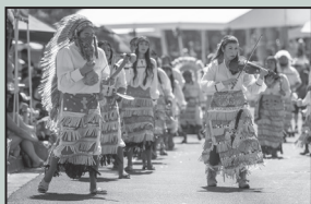
Danza Del Carrizo Second Place