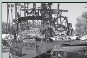
Factory Powersports Second Place