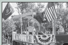
Greater Nevada Detachment 186 Marine Corps League - Third Place