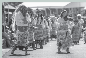
Danza Del Carrizo First Place