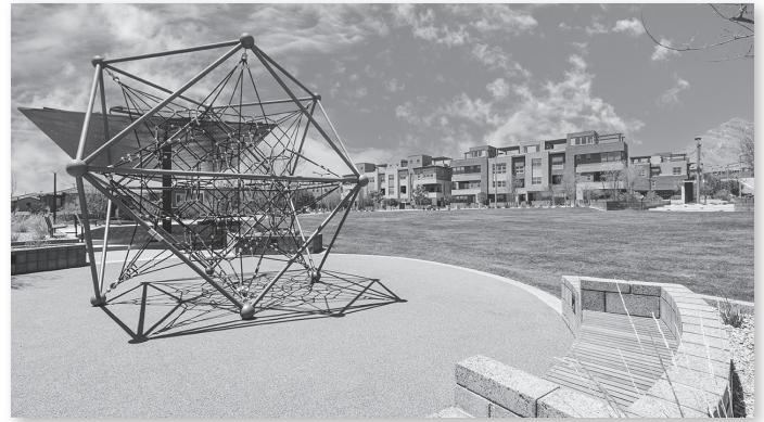
Two new parks, Explorer Park and Redpoint Arroyo, recently opened in the community's growing western region. Fun fact: Explorer Park's distinctive shade structure was created to represent multiple constellations and stars reflective of a November sky when summer constellations are fading and winter constellations are on the rise, dominated by three popular star groups.

"Considered functional grass areas that accommodate play, sports, recreation and social gathering, parks play an even more important role in the community in light