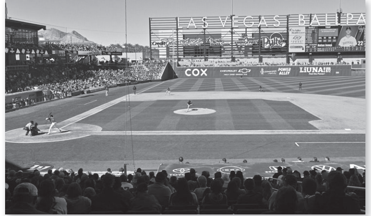
Baseball season at Las Vegas Ballpark kicks off in March with Big League Weekend, March 8-9, and season opener March 29 - 31.

Later this month, the Las Vegas Aviators® of the Pacific Coast League will kick off the team’s 41st season with a three-game homestand series, March 29 - 31, against intra-state rival, the Reno Aces, Triple-A affiliate of the Arizona Diamondbacks. The Aviators 2024 schedule features a total of 150 games with 75 away games and 75 home games at Las Vegas Ballpark.