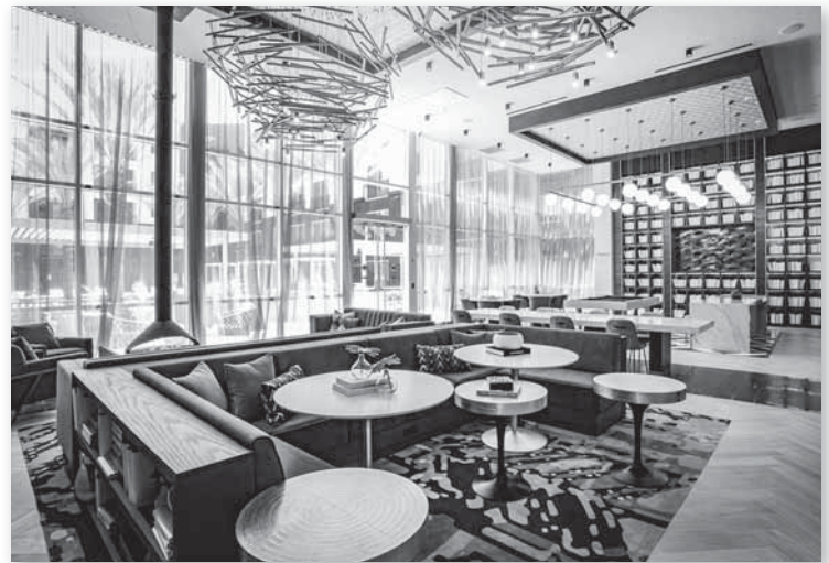
Tanager Echo, Downtown Summerlin's newest luxury apartment building, was recently named the winner of Urban Land Institute's 2023 Placemaking Award in the Transformative Category, Suburban Division.

Situated on nearly three acres just south of Las Vegas Ballpark, Tanager Echo boasts significant common area space that is dedicated to onsite amenities including collaborative co-working space, a sports simulator lounge and a boutique-style pool with cabanas, lounge seating and a grilling area. An adjacent spa suite features a tan-