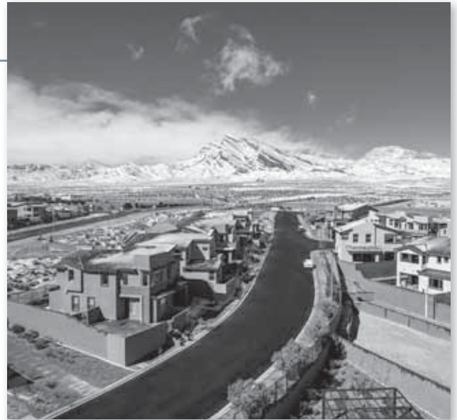
During 2023, Summerlin opened six new neighborhoods and completed significant developments at Downtown Summerlin, including new office and luxury apartments. 2023 marked another year of milestone development for the community.

During 2024, Summerlin is anticipating the opening of five new neighborhoods plus a scattering of parks and