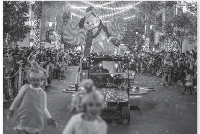
Downtown Summerlin is your holiday headquarters this year with the annual holiday parade that opens on Friday, November 17. Check Summerlin.com for all the details that will make your holiday extra special!

Downtown Summerlin will partner with Jewish Nevada to host a one-night Hanukkah celebration on December 13 that includes the lighting of the Menorah, family skate