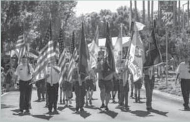
American Legion Post 76 First Place