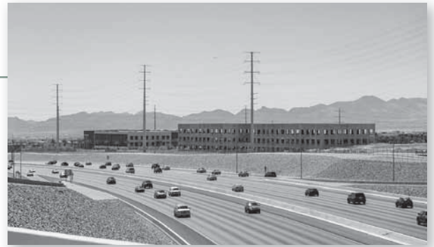
Two Class-A office buildings with high visibility from I-215 are under active development by The Howard Hughes Corporation. Located between Town Center Drive and W. Flamingo Road in the southern region of the community, the buildings will meet growing demand for office space in the area.