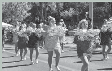
Vegas Golden Gals First Place