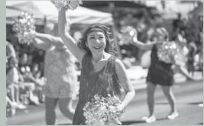
Vegas Golden Gals Third Place