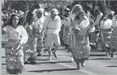
Danza Del Carrizo de Ciudad Juarez Second Place