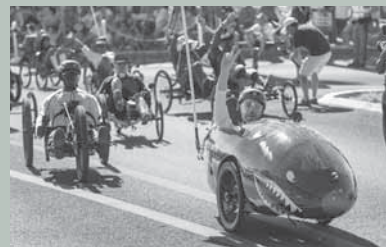
Forgotten Not Gone Veteran Trike Brigade Second Place