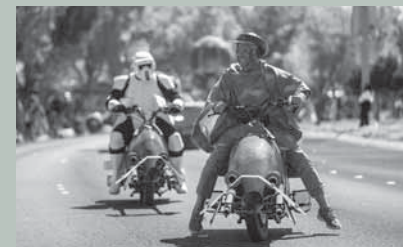
Star Wars Speeders Third Place