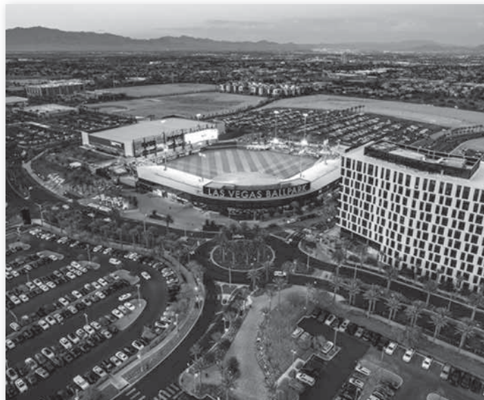
Summerlin continued its remarkable, decades-long trajectory in 2022, capping off a year of milestone development in Downtown Summerlin®, with focus on a new 10-story, Class-A office building, 1700 Pavilion.

Downtown Summerlin's retail offerings grew during 2022 by the addition of six new brands, including The Raider Image, Altar d'State/Arula, Kendra Scott, Daiso Japan, The Bagel Nook, and IS Luxury. Helping to drive Downtown Summerlin's annual visitation numbers to record highs during 2022 were major events, including the Summerlin Festival of Arts and the destination's popular seasonal parades: Lunar New Year; Halloween Parade of Mischief; Holiday; and new to the line-up in 2022, Lei Day