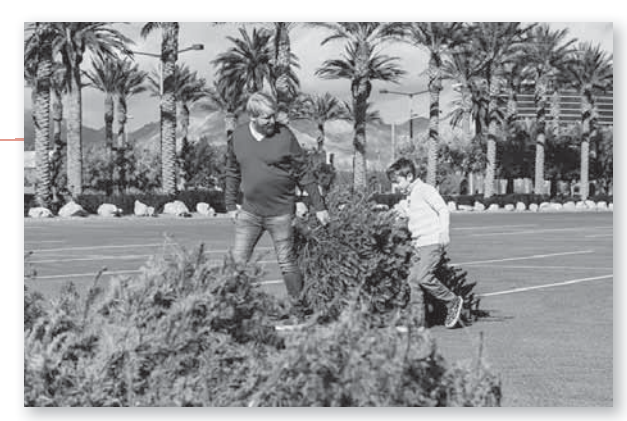
Christmas Tree Recycling returns to the community December 26 - January 15 at two locations in Summerlin. Information at SpringsPreserve.org.

Through January 15, Summerlin residents can drop off their real Christmas trees at two Summerlin locations: the lot adjacent RC Willey Home Furnishings, 3850 S. Town