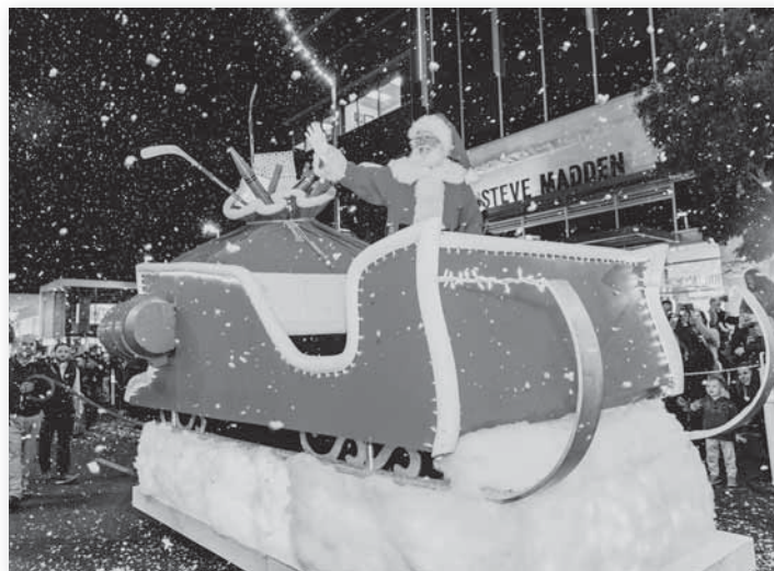
The 2022 season kicks off with the return of popular holiday activations headlined by the arrival of Santa Claus, the return of the beloved Holiday Parade and the opening of Rock Rink, an outdoor skating rink, on Friday, November 18.

Returning to Downtown Summerlin is The Giving Machine that will be open from mid-November to year-end.