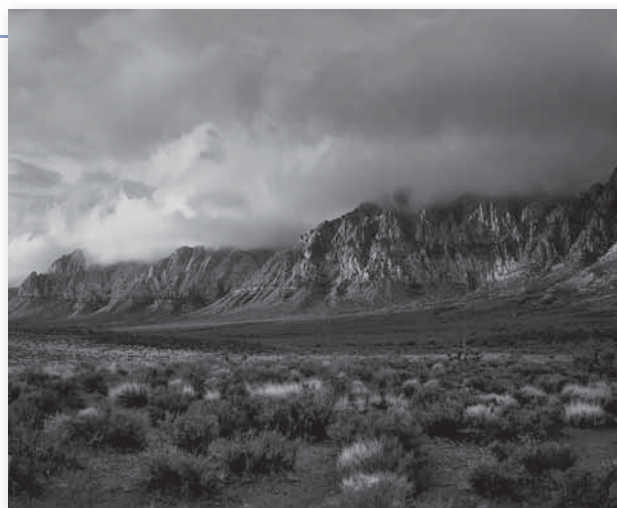
This photo by Michael Rogers was one of many winners in the 2021 Summerlin Photo Competition.

Photographers are invited to submit photos in three categories: architecture, man-made landscapes and