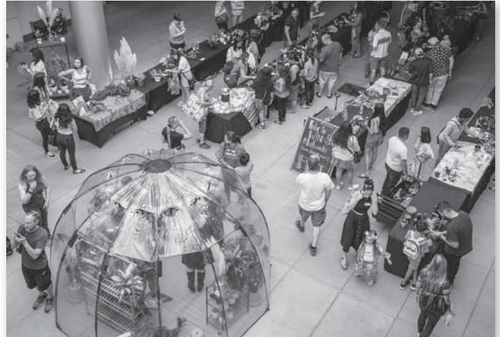
A plant swap, led by Carrie Lynn's, a retail store at Downtown Summerlin, takes place on Saturday, April 23 from noon to 3 p.m. as part of the Happy Earth Day LV Festival. For information on all Earth Day events and activities at Downtown Summerlin that weekend, visit Summerlin.com .

Summerlin Half Marathon and Tour de Summerlin - April 23. Returning to Summerlin after a two-year hiatus are two popular wellness events that celebrate the