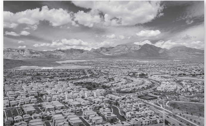
2021 was another record year of home sales, milestone developments and continuing evolution of Downtown Summerlin.

At Downtown Summerlin, construction on two major projects began during the year. They include 1700 Pavilion, a ten-story Class-A office building that is expected to be complete by fourth quarter 2022. Downtown Summerlin's third Class-A office tower, 1700 Pavilion is already enjoying