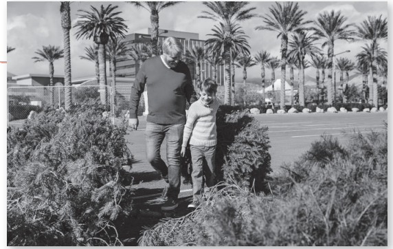
Summerlin residents are once again encouraged to recycle their real Christmas trees with two drop-off locations in the community, open from December 26 through January 15.

Through January 15, Summerlin residents can drop off their real Christmas trees at two Summerlin locations: the lot adjacent to RC Willey Home Furnishings, 3850 S. Town