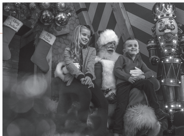
The 2021 holiday season kicks off at Downtown Summerlin® on Friday, November 12 with the arrival of Santa Claus and the opening of Rock Rink. The following weekend, the beloved Holiday Parade returns, running every Friday and Saturday evening at 6 p.m. from November 19 – December 18.

Santa Claus’ Chalet, presented by Tri Pointe Homes and located in the Macy’s Promenade, is open daily through December 24. Photo packages start at $39.99. Santa offers photos with pets on Tuesdays through December 21 between 7 p.m. and 9 p.m. Kids can drop off letters to Santa and for every letter received, Downtown Summerlin will donate $1 to Goodie Two Shoes.