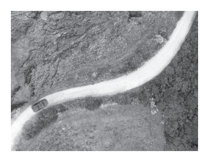
Our focus has always been your vision