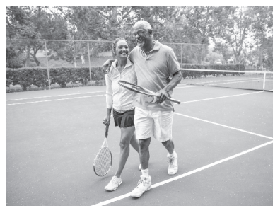
Our focus has always been your vision

Centennial Hills 6850 N. Durango, Suite 404, Las Vegas, NV 89149