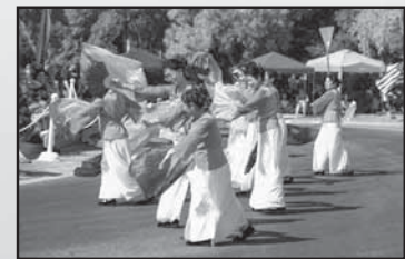
Las Vegas Spring Breeze Dance Group Third Place