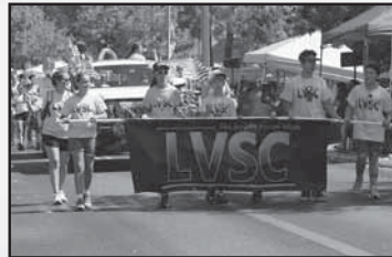
Las Vegas Swim Club Second Place