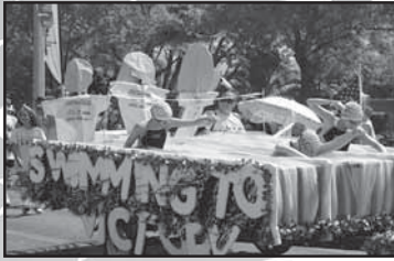
Las Vegas Swim Club First Place