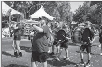
Palo Verde High School "Panther Pride" Marching Band - Second Place