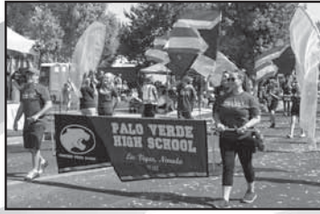
PVHS "Panther Pride" Marching Band Second Place