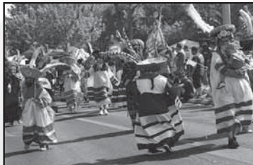
Comparsa Morelense First Place