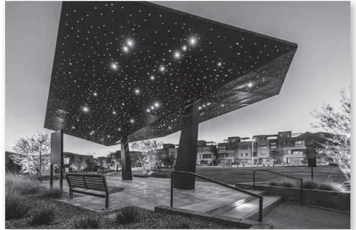
Explorer Park in the district of Redpoint Square features a celestial canopy inspired by nighttime constellations. It's one of several stops on the suggested Summerlin Day Trip route that includes new neighborhoods and landmark venues in the community.

After a full morning, stop for lunch at Downtown Summerlin® , that features more than 30 unique eateries and