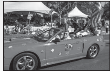
American Legion Post 76 Third Place