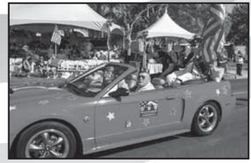
American Legion Post 76 Third Place