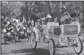
Forgotten Not Gone First Place