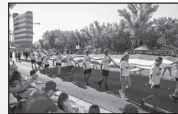
Palo Verde High School Track and Field & Cross Country - Third Place