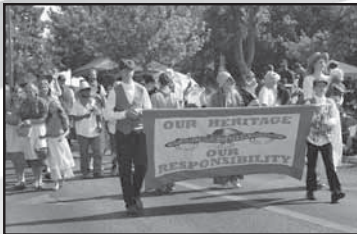
Daughters of Utah Pioneers Clark Nevada Desert Springs Co. - First Place