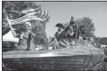
Daughters of the American Revolution Francisco Garces Chapter - Second Place