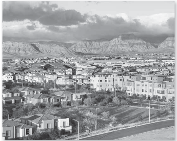
Seven new neighborhoods have recently opened in Summerlin, adding nearly 40 new floorplan options for homebuyers – including both single-family homes and attached townhomes. These new neighborhoods are all located in the growing and popular western region of the community.

Ashland by Taylor Morrison , also located in Grand Park village, offers seven single-story floorplans from