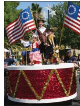
"SPIRIT OF '76"