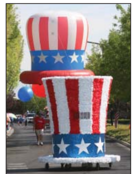
"HATS OFF TO THE USA"