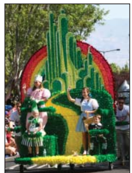
"OVER THE RAINBOW"